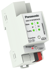
KNX IP INTERFACE TP